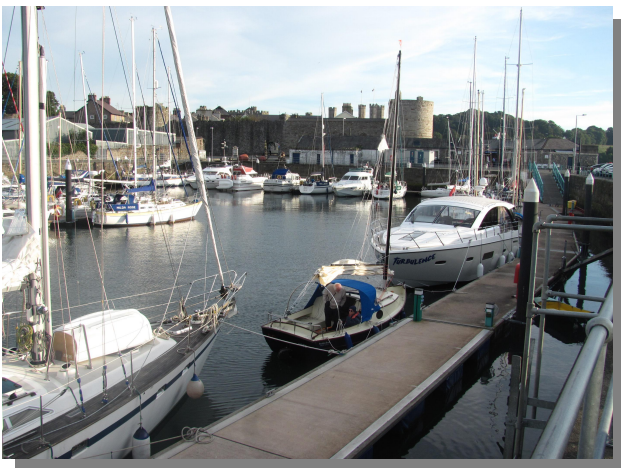
GIGI feeling vulnerable between large yachts on the marina's old pontoons