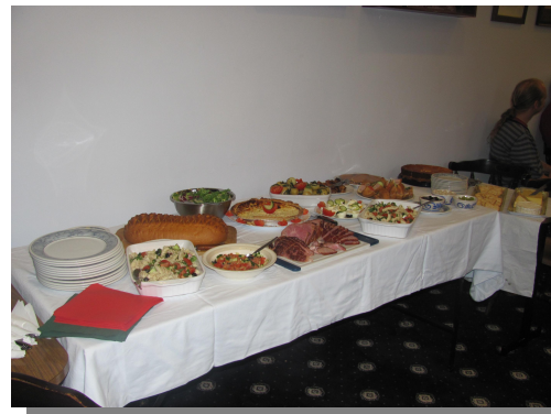
Wetting our whistles before dinner, and the sumptuous RWYC buffet