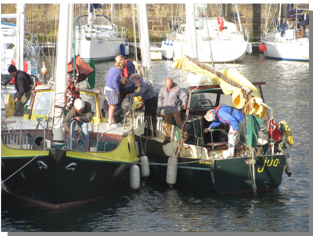
Organised chaos?