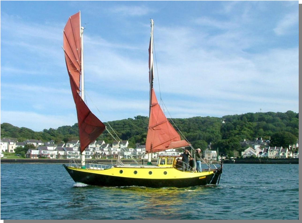
Badger running in the Menai Straits