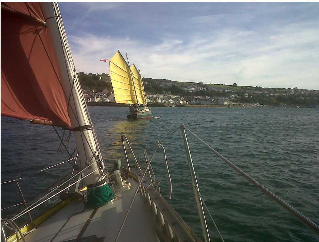
Saturday - Jua leading the way back with Badger