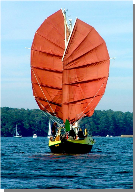
Badger showing off her sails (Roy Denton)