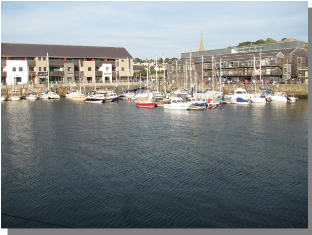
Victoria Dock Marina's new berths in 2012, soon filled, surrounded by restaurants