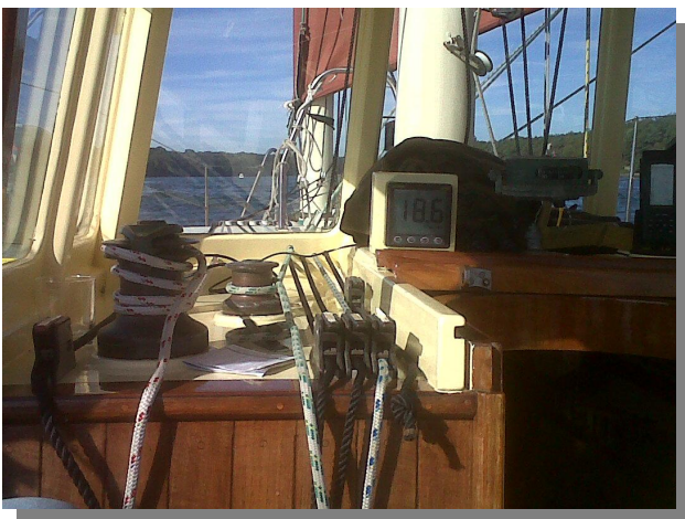
Helmsman's view through Badger's doghouse