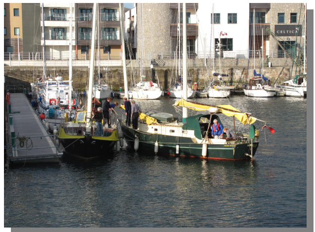
Jua and Badger rafting up