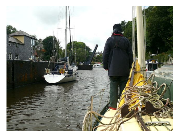
Entrance to Port Dinorwic