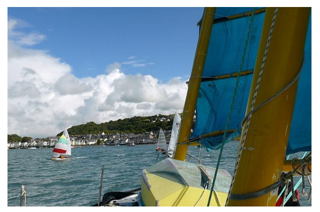
As we approached Port Dinorwic we had to thread our way carefully through a fleet of dinghies