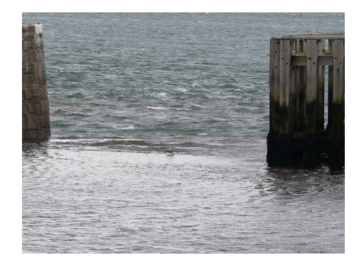
The dock entrance viewed from the straits and with gate raised viewed from inside the dock

A half tide gate at the entrance to the dock maintains a depth of water around two metres throughout most of the dock.