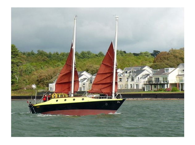
Badger sailing outside Port Dinorwic

The Straits run from south west to north east and when strong winds blow from one of these directions creating boisterous sailing conditions, the opposite side of the Swellies are usually much calmer. This year we had strong south westerly winds. Unfortunately there is insufficient time for us to sail through the Swellies to calmer waters and get back again on the same tide so we are restricted to sailing between Caernarfon and the Menai bridges.