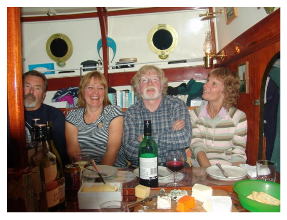
Members on board Badger after the rally

Jua's home port is Port Dinorwic and she has to return to her base rather than Caernarfon at the end of the day's sailing to be in time to lock in. Her skipper then returns his crew to Caernarfon by road.