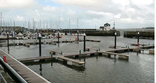
View of pontoon berths and visitor pontoons and the new but yet to be commissioned pontoons