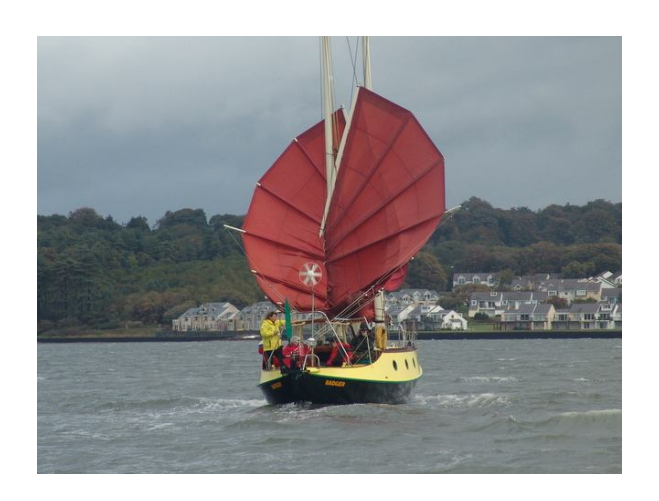
Badger sailing wing and wong