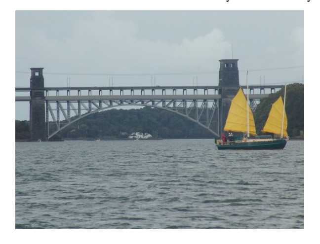
Jua sailing in front of the Britannia Bridge

Victoria dock has 49 fully serviced pontoon berths along with a visitors pontoon where, in busy periods, yachts have to raft up under the supervision of the dock master. The pontoon berths occupy only about half of the dock however tour surprise on this visit we found the other half of the dock now serviced with pontoon berths although not yet commissioned we were informed they would be fully operational for the 2012 season.