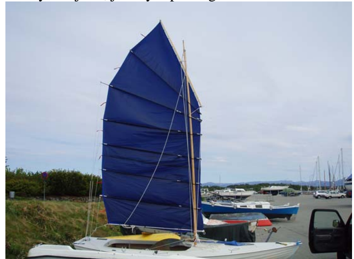
.. from the rigging of Broremann in 2009, the Tiki 21 sits in the background...

In my harbour sits a Tiki 21 catamaran which the owner doesn't use. I bet that this could also have been converted to hybrid junk, just by replacing the mainsail. That would have been fun!