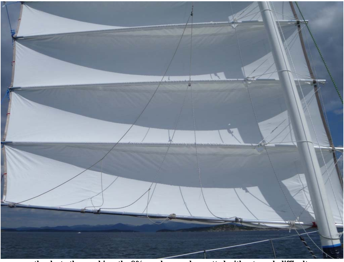
\ldots thanks to the sunshine, the 9% camber can be spotted without much difficulty...

As can be seen, the maximum camber point is well forward of the middle and there is no hooked leech. Ordinary, plain barrel cut method was used to achieve the camber.