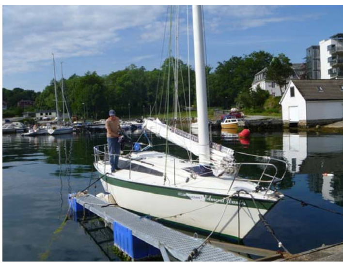
.. back in Ramsvig...

When we met a couple of other sailboats, we soon went into racing mode and despite the wind being light and the other skippers trimming their sail like mad, we overtook both.