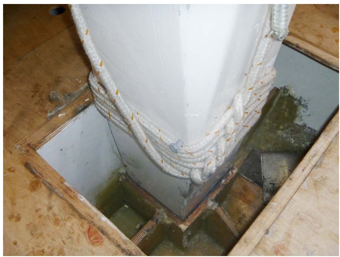
15:19 .. with me guiding it into its step, down below. Easy ...