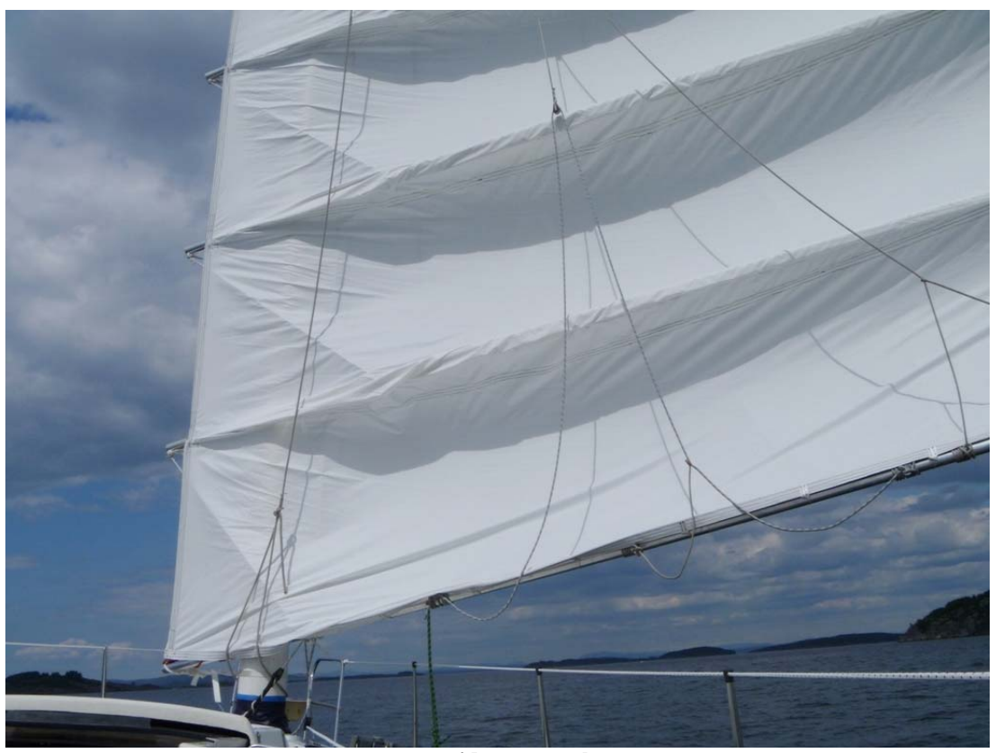
.. port side, port tack...

The sail doesn't look perfect from this side with more wrinkles at the battens and the mast and HK parrels trying to spoil the shape. For some reason the sail still feels powerful and close-winded enough and the telltales at the leech are still easy to make fly.