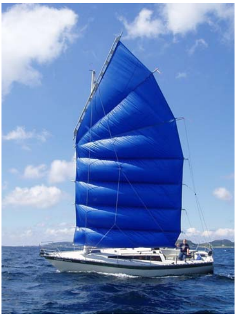
..ED in 2006 with the new blue sail ...

In Part one the construction of the sail during 5-6 hectic days in June was described in detail. This part will show a little of what it took to get Edmond Dantes back under sail again and the bits and strings needed. In case you are new to the junkrig, I suggest you print out "Junk Rig for Beginners" which will help you to sort out the strings. This article will mainly be a chronological print-out of the pile of photos I took, with some comments added in between.