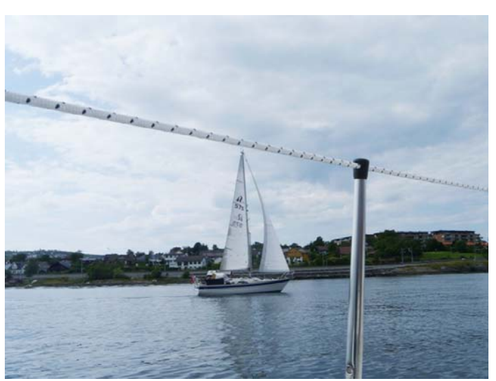
.. later against a HR312 on a beam reach...