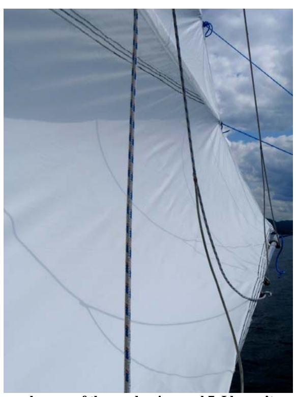
.. a close-up of the camber in panel 7. I haven't control-measured it, but it surely looks generous...

The sail doesn't look perfect from this side with more wrinkles at the battens and the mast and HK parrels trying to spoil the shape. For some reason the sail still feels powerful and close-winded enough and the telltales at the leech are still easy to make fly.