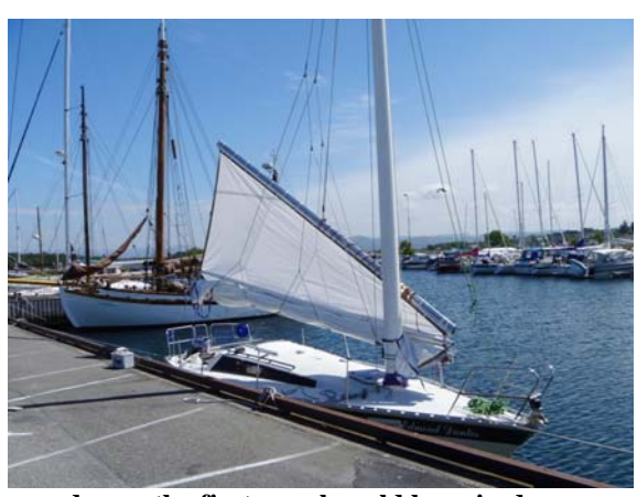
.. and soon the first panel could be raised...

The pre-assembled sail bundle was brought on board and with the mast lift and tack parrel fitted, the halyard could be used to lift the bundle into position. Then the lazyjacks could be