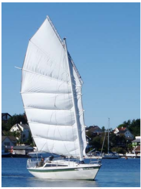
.. and in 2012 with the new white one...