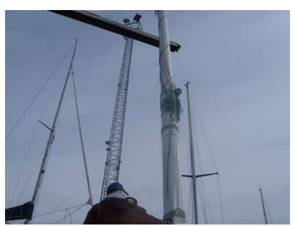
..15:13, the mast is gently lowered into ED...