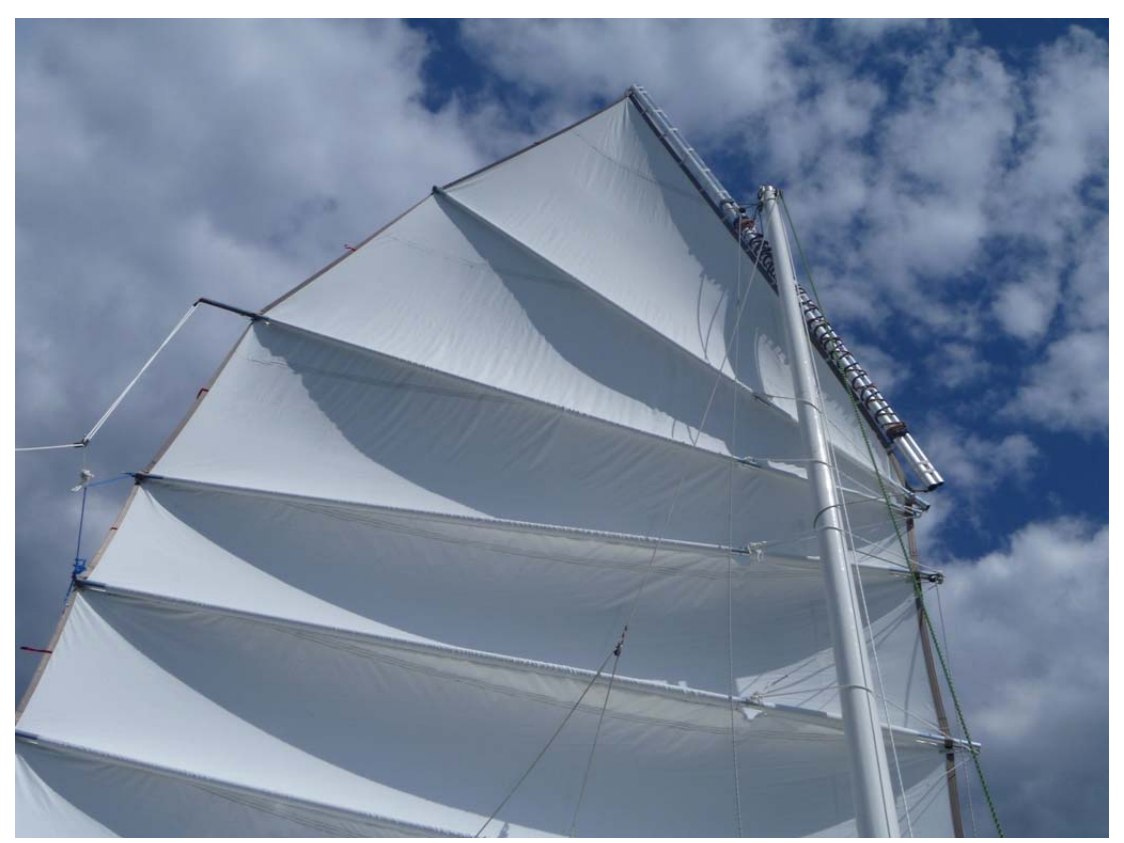
.. sail fully up and...