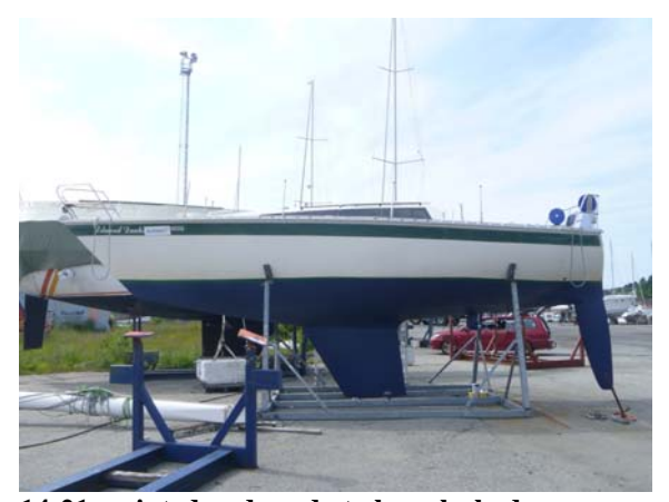
14:21, painted and ready to be splashed...

ED had been on the hard in a marina for over half a year so needed to be fixed a bit and launched before rigging could start.