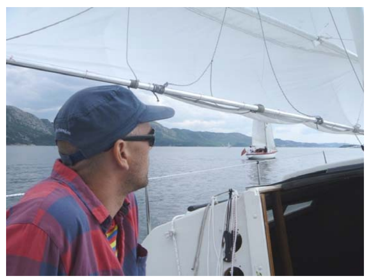
..racing against a Smiling, upwind and...