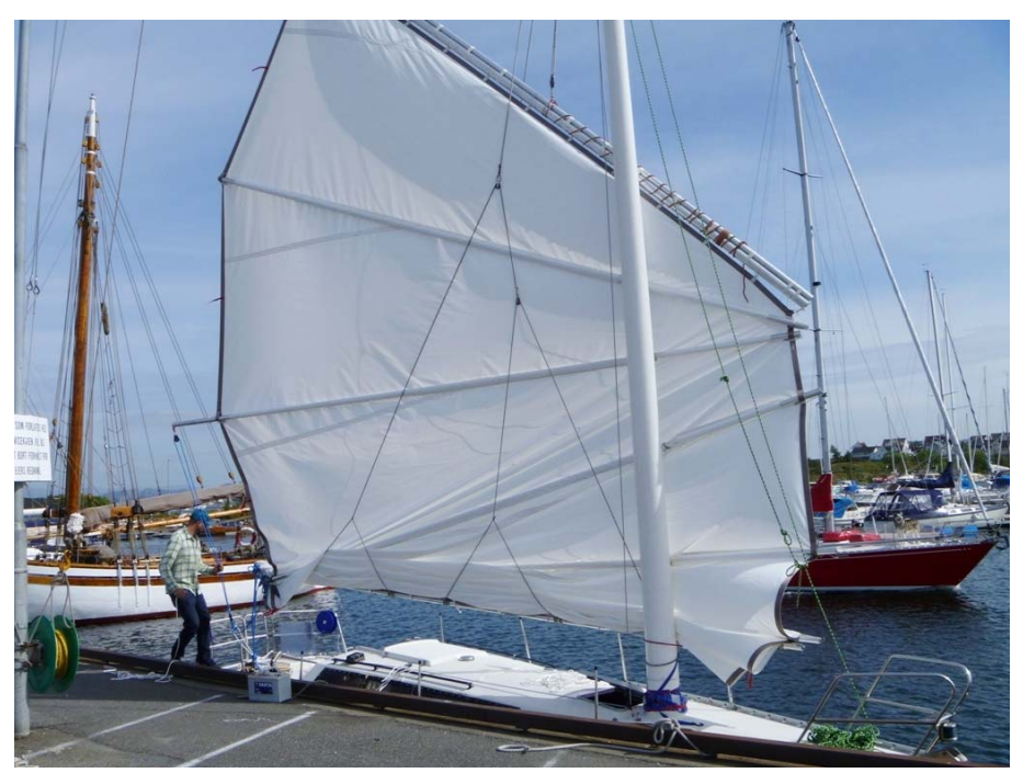
.. 3.5 panels up - looking far from tidy, but still boosting out spirits...

tied to the boom. Finally the halyard could be eased and with the lazyjacks doing their job, the yard could be brought on board and tied to the head of the sail. The halyard block of the 3-part halyard was just tied to the yard: No drilling of holes should be done in this high-load spot of the yard. The position of this slingpoint has later been shifted back and forth a bit.