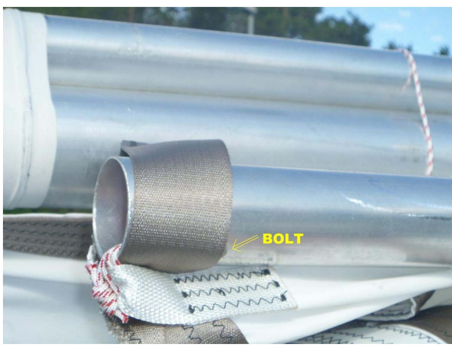
.. leech end of batten 1...

At least I got in one detail this day: On the photo above it can be seen how the sail has been tied to the batten to ensure that the batten will not stick out and catch the sheets when gybing. The white webbing loop is lashed to the bolt passing through the batten. The sheet will also be tied to this bolt on the lower battens - batten 1 has no sheet.