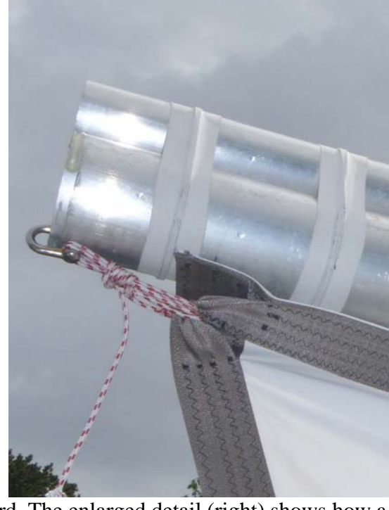
Above shows how the sail was tied to the yard. The enlarged detail (right) shows how a little shackle is fitted to take the peak lacing. This method was used many places, at both ends of the yard and at the luff end of the battens as well.