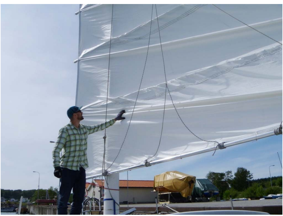
.. the sail fully hoisted for the first time - still much to do...

By the end of that day we had still not fitted fixed parrels like batten parrels , Hong Kong parrels , nor the tackline . The running lines like lufft hauling parrel and yard hauling parrel were also not fitted yet, but at least the Johanna-type sheet was on. The result can be seen with really impressive diagonal creases, stealing the camber from each panel.