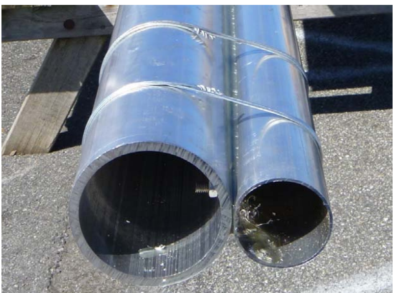
The yard; one 80mm plus one 50mm tube tied, glued and bolted together..

The yard was meant to be of the welded, braced type similar to Johanna's, but with the main tube beefed up from 65 to 80mm. Unfortunately the welding shop was too busy to do it before the summer holidays, so we decided to construct a makeshift yard of the tubes instead. We tied the two tubes together, at intervals of about 40cm, with 1.5mm galvanised steel wire. In addition the groove between the tubes was filled with a thin string of epoxy. Then, at both ends the tubes were bolted together to take the sheer forces wich effectively turned the two tubes into one beam. Finally we covered the wires with sports tape.