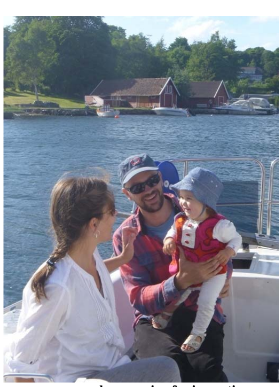
.. more crewmembers coming for inspection...