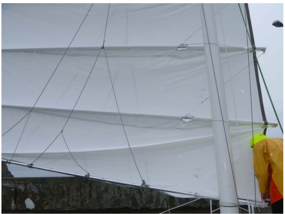
..all HK parrels fitted except to the lowest panel...