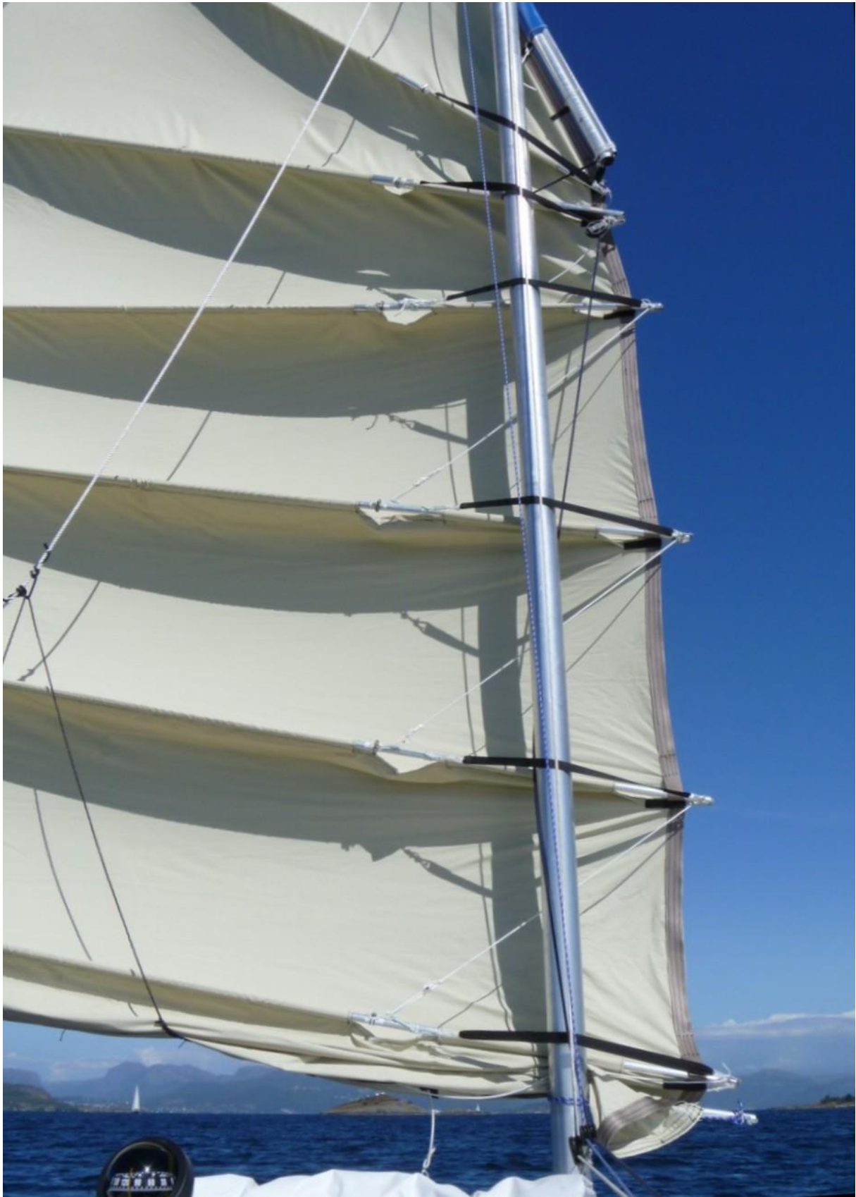
This photo shows how the (black) long end of the THP is lead aft and around the mast.