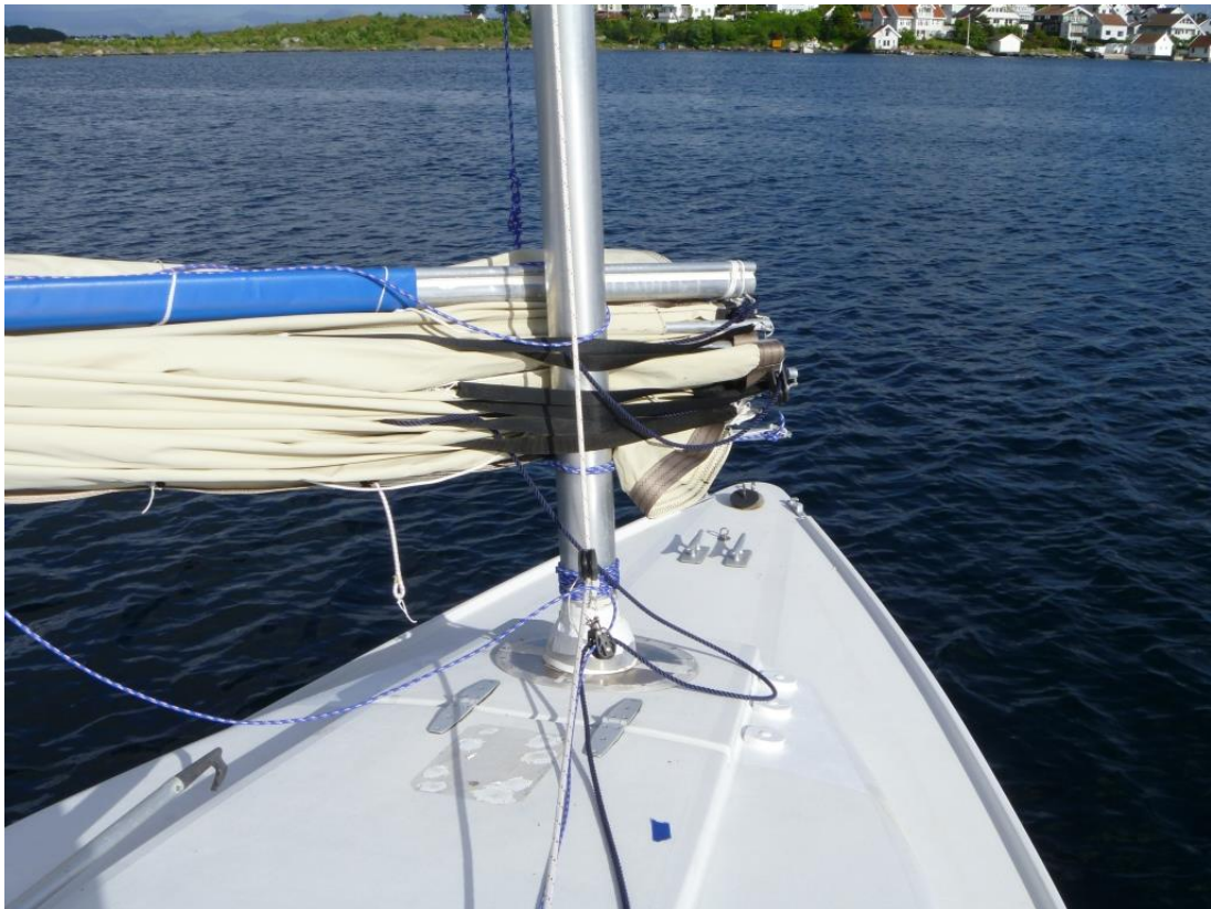
..here the sail has been dumped. As said, it looks as if the slack bight of the THP falls further aft than it used to be. Hopefully that will improve the statistics...