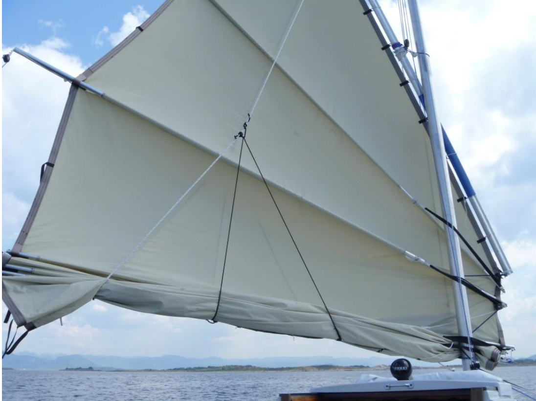
The new lead of the THP is at least as good for deep reefing as the old one...