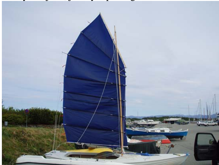
.. from the rigging of Broremann in 2009, the Tiki 21 sits in the background...

In my harbour sits a Tiki 21 catamaran which the owner doesn't use. I bet that this could also have been converted to hybrid junk, just by replacing the mainsail. That would have been fun!