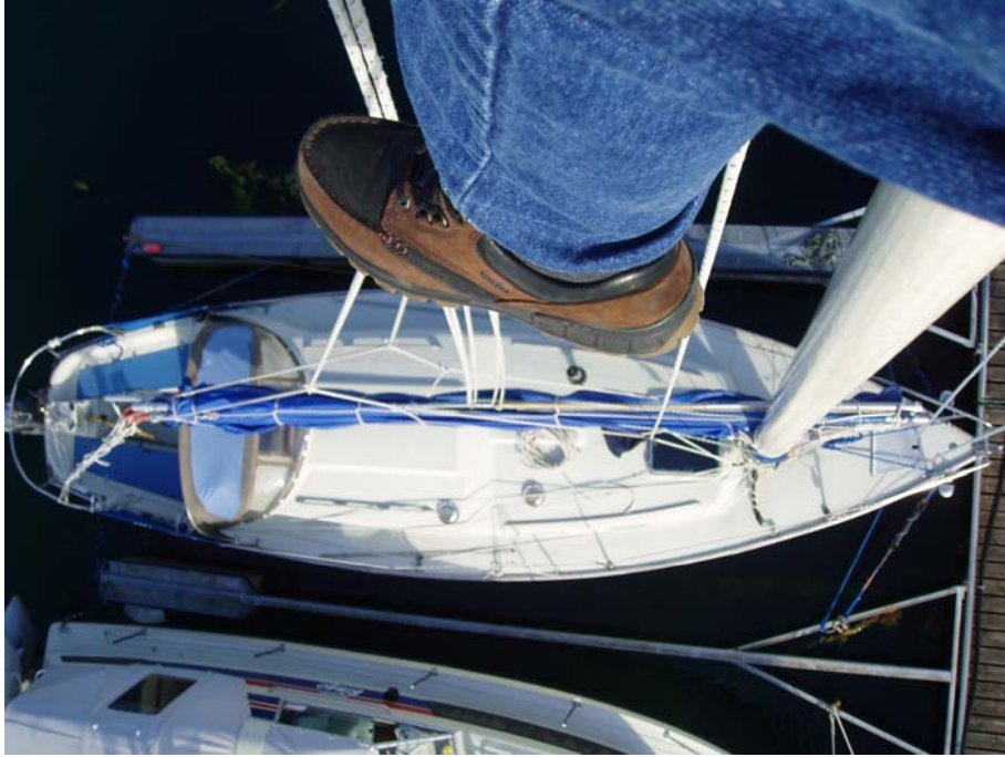
Perspective... who needs a dinghy with that...