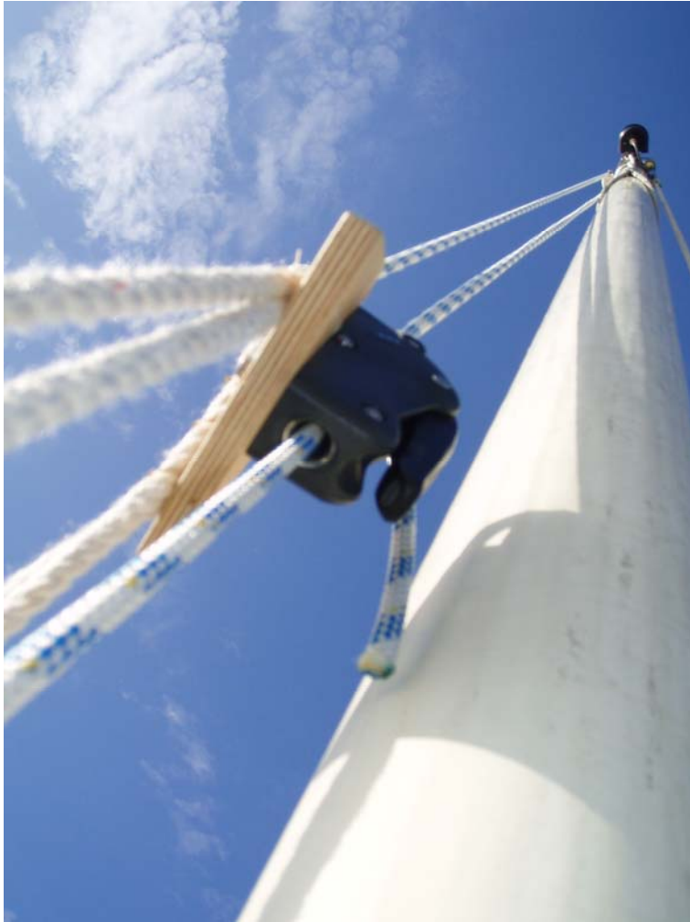
Half-way up Johanna's mast