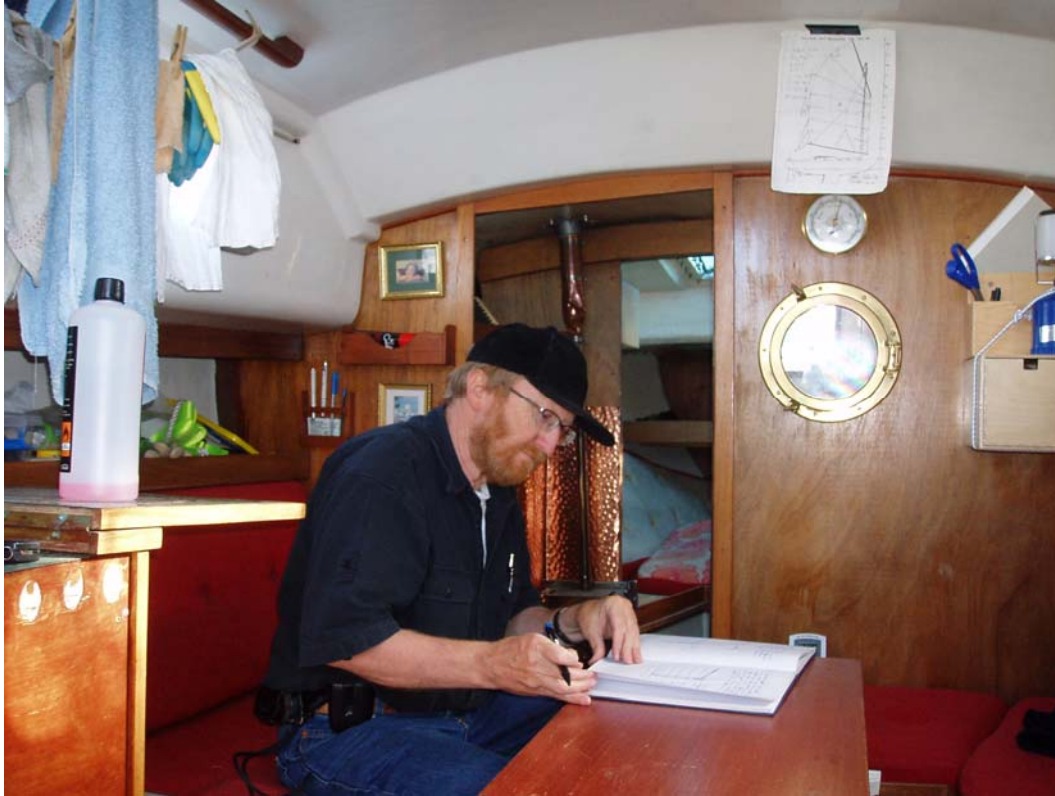
Inside Johanna. Logging a good day's work.