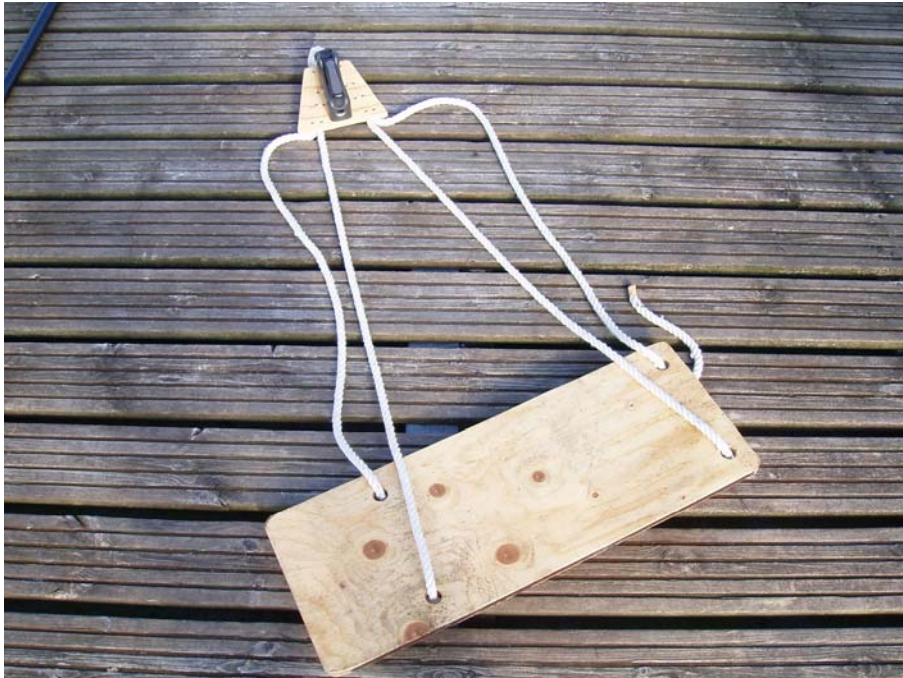
The standard bosun's chair with a sheet-lock added.

The bosun's chair method I think is slightly less sensitive to the boat's rolling and pitching, than using ladders (hoisted rope-ladders) or using mast climbing irons ( ..depends on make of course...)