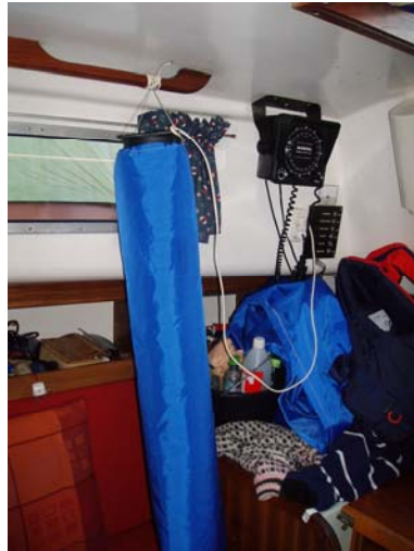
..sucking air from above...