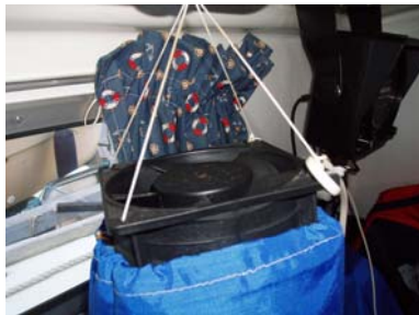
The fan, tied to a bridle

battery. For longer heating, when the cabin has been warm for some hours, the walls and the mattresses have reached the same temperature as the air. Then the fan can be turned off.