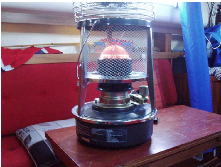
The Fuji portable paraffin heater. Note the red-hot metal mesh. Produces about 2000W

The next is the portable paraffin heater, made by Fuji . I only bring this one on board during winter. Despite having no flue and the fact that it burns standard paraffin/kerosene, it makes no smell at all – if one does it correctly. The trick is to light it out-doors and not take it inside until it has become hot, with a red glow from that metal mesh. The hot mesh radiates a lot of heat right at you, not unlike a camp fire, so it is no bad idea to let it stand on the table. It is also possible to cook on it, although it is slower than the Optimus of course. Both the cooker and this heater let the CO 2 right into the cabin so keep the hatch a bit open for ventilation.