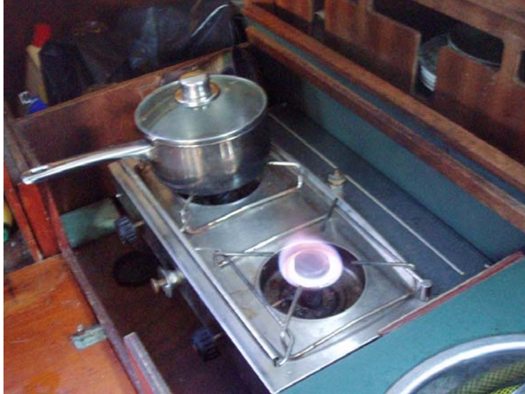
The Optimus cooker, producing about 2000W on one burner

The Optimus paraffin cooker is number one. It brews the coffee in the same run. Not much to say about it. If you are used to paraffin cookers, how to preheat them etc. they are safe and easy to use. A bit smell from the paraffin, but not much