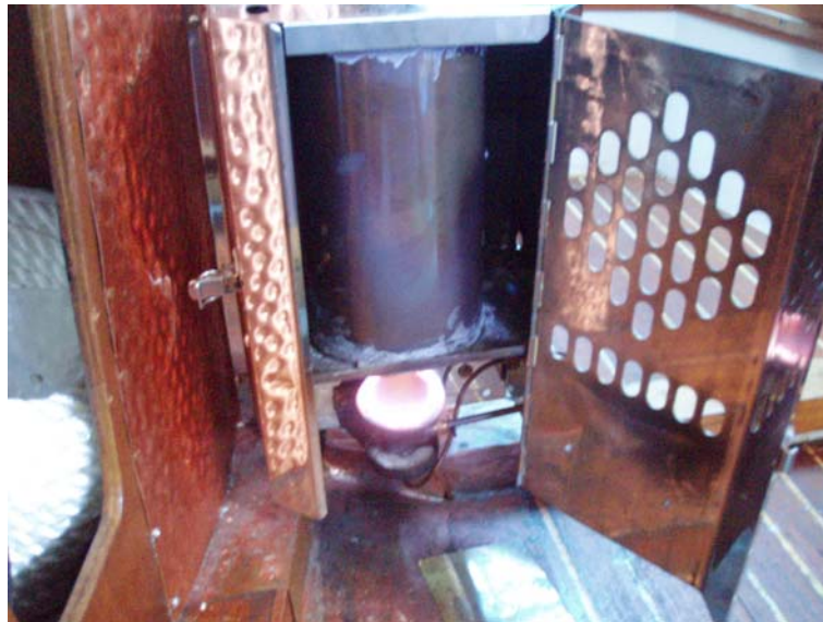
..the Taylor with a paraffin heater. Door open...

Last but not least is the Taylor paraffin heater . When I bought Johanna, she came with an old diesel version of the same make, the one with a pot burner. The inside was burned/rusted out, and since I had had one before which was rather temperamental in use, I decided to give the one with a paraffin burner (Primus type) a try. This is basically the same as the burner on the cooker, but thanks to the flue, it ventilates out the exhaust gases. It is claimed to produce 2000W, but since some of it goes out with the flue, I guess it can not compete with the Fuji or Optimus on brute heat. Still, this is the one I keep running after the cabin has been heated up and I have to start shutting down the others (.. to avoid a fast melt-down...)